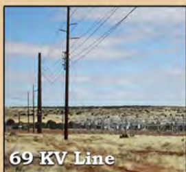
69 KV Line