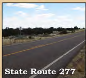
State Route 277